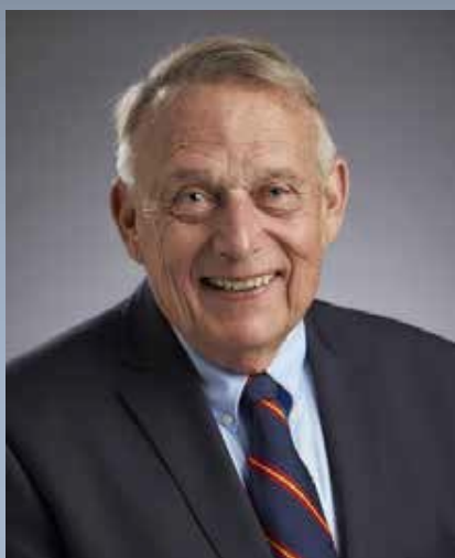
Martin J. Schreiber

Former Governor of the State of Wisconsin and Family Caregiver