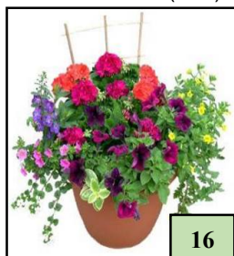
16" Awesome Combo Patio Tub (Sun)