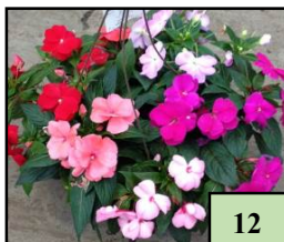
12.8" New Guinea Mixed