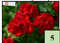
12.8" Geranium Dark Red (Sun)