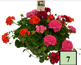
12.8" Geranium Zonal Mix