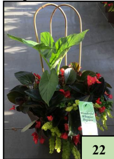
14" Square Whopper Begonia Combo Tub