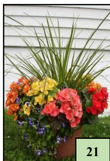
16" Begonia Reiger - Mixed