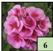
12.8" Geranium - Rose Mega Splash