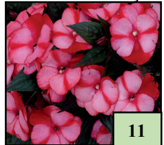
12.8" New Guinea Sweet Cherry