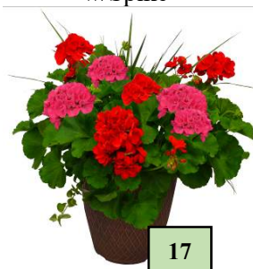
13" Mix Geranium w/Spike