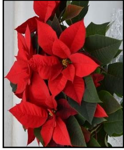
6.5" Red GH5320PC 8" Red GH5590PC

8" Poinsettias (approx. 18" plant diameter)