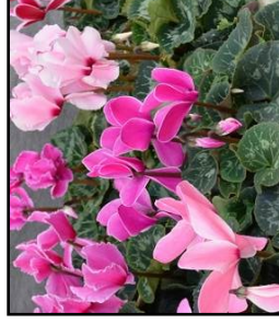
Pink & Purple Shades GH5237PC