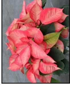
6.5" Premium Ice Crystal GH5277PC 8" Premium Ice Crystal GH5593PC