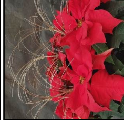
Red – GH5600

8" poinsettias all dressed up for the holidays! Decorated with glittering sprays, organza, and in a glittering snowflake pot.