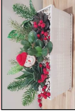
Holiday Succulent Garden GH80113 - New design! Live succulents and decorative seasonal accents. Water lightly when soil is dry. 12" x 4" Planter w/drip tray. Plant varieties will vary.