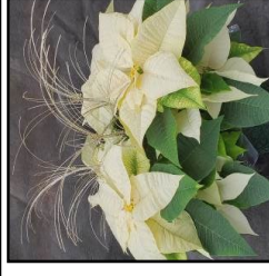
White – GH5605