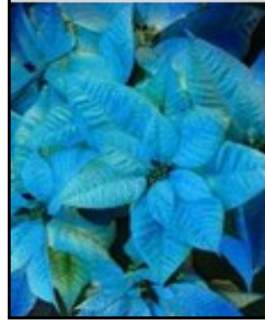
6.5" Blue Holiday Painted Poinsettia GH5283PC

*Painted Poinsettias are live, natural poinsettias, air-brush painted by hand for a whole new look!