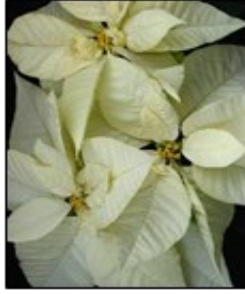
6.5" White GH5344PC 8" White GH5595PC