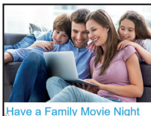
Have a Family Movie Night