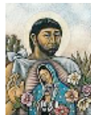
Row One - Blessed Pier Giorgio, St. Andre Bessette, St. Pope John Paul II, Mary Mother of God, St. Polycarp