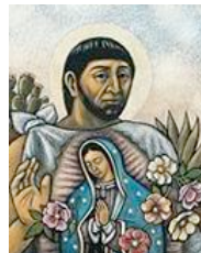
Row One - Blessed Pier Giorgio, St. Andre Bessette, St. Pope John Paul II, Mary Mother of God, St. Polycarp