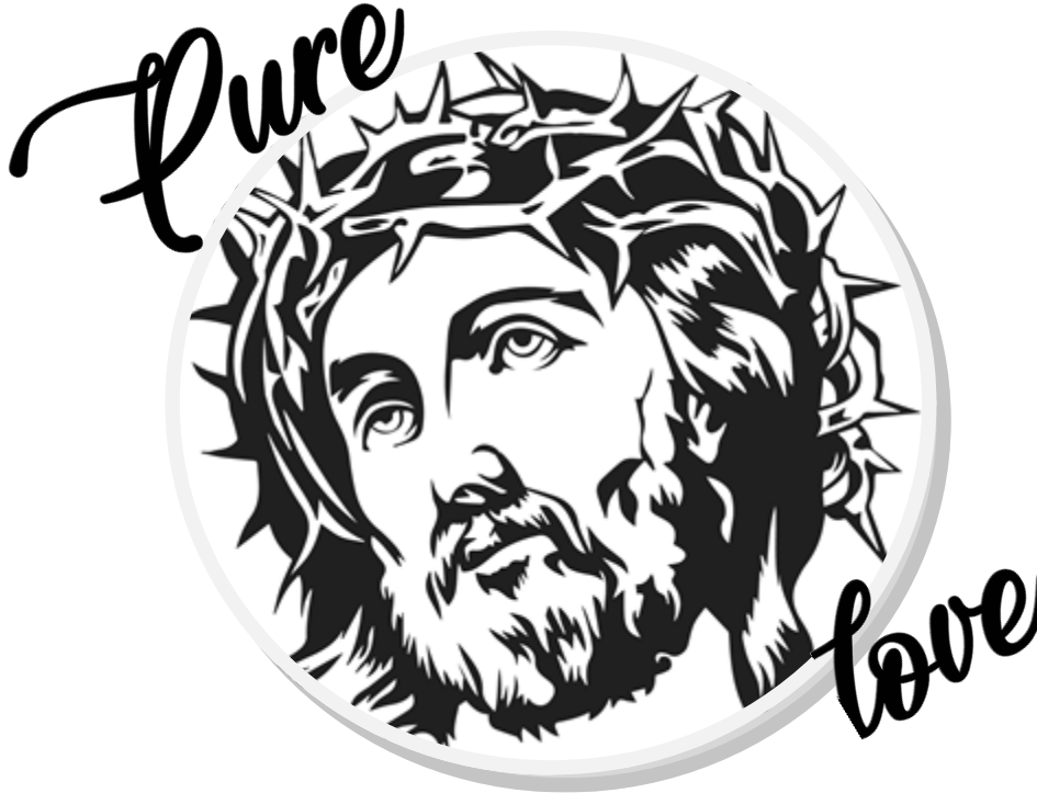
(Approximate t-shirt design.)

Must be going into 7th gr. or older. If you are interested, please fill out the form below.