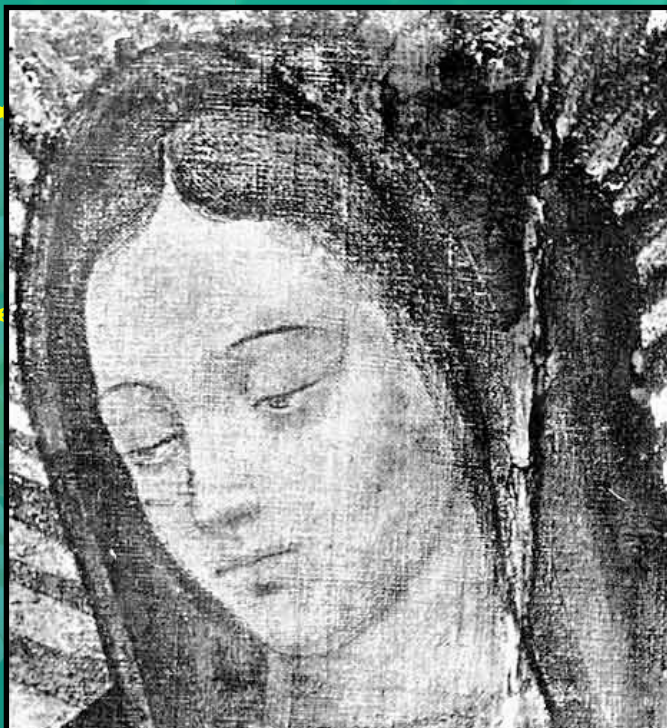
Close-up of Our Lady of Guadalupe