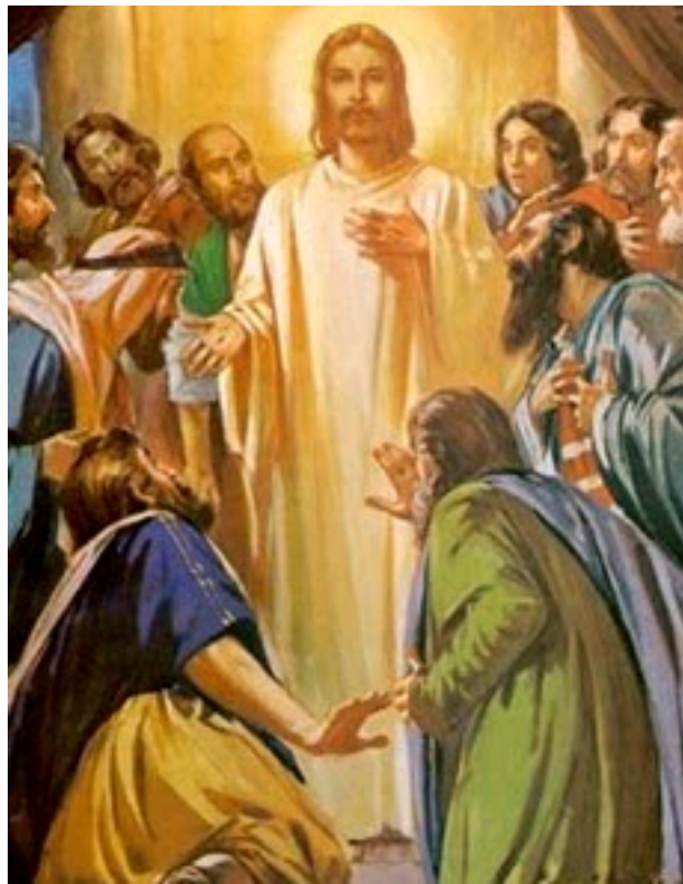
"Thomas...said to him, 'My Lord and my God!'"

Saint David 225 N Wilbur Street Broadus, Montana