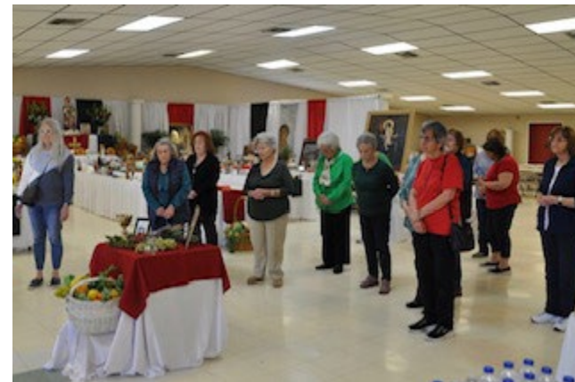
SOME OF OUR ST.JOSEPH ALTAR VOLUNTEERS PRESENT FOR THE BLESSING OF THE ALTAR!!