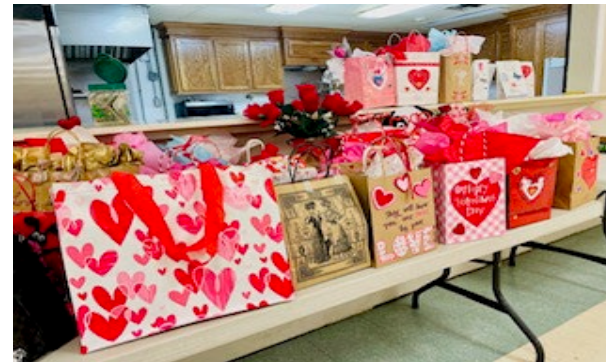
VALENTINES BAG EXCHANGE at our February Meeting!! Hard to choose with all the beautiful bags!!