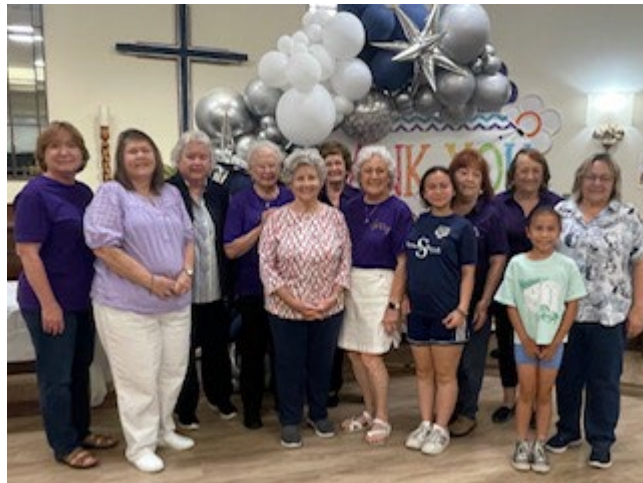
Our volunteers were treated to a party celebrating all the volunteers who make such a difference to their residents!