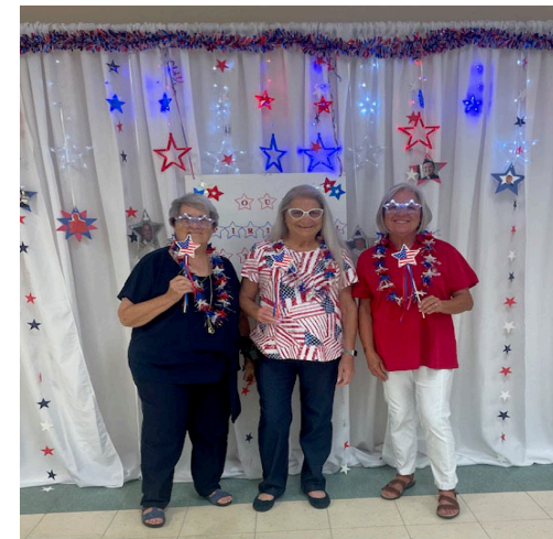
PATRIOTIC THEME FOR THE OCCASION