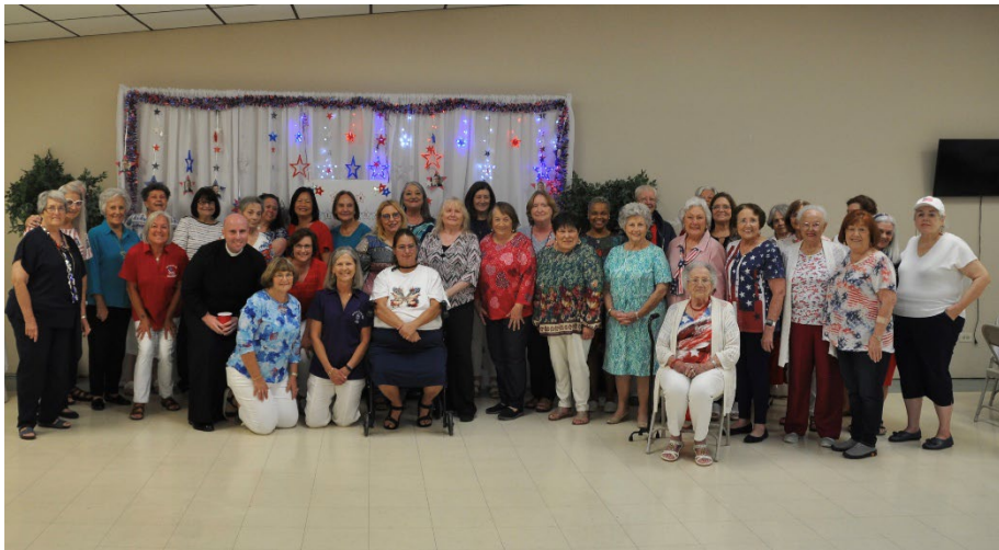
We love our Priests and Deacons! Prayers for them and for Vocations always! God Bless our Priests and Deacons!