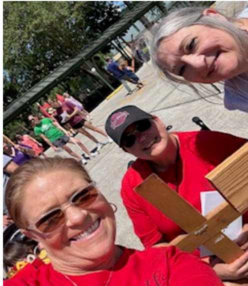
CDA SISTERS PARTICIPATE IN WALK!!

A wonderful dinner was cooked and served to us by the St. Bernadette KC Council at our May meeting. It was in appreciation for all the volunteer hours that our ladies give to our Parish, Community, and to God!!