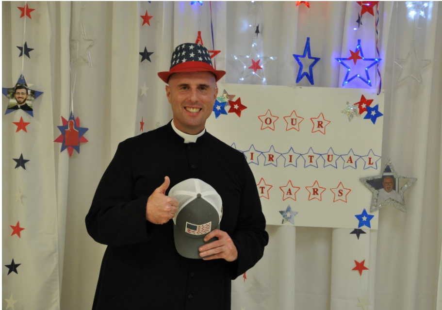
PRIEST AND DEACON APPRECIATION DINNER