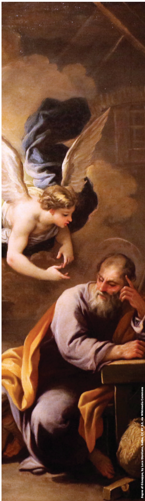
Segno di Giuseppe, by Luca Giordano