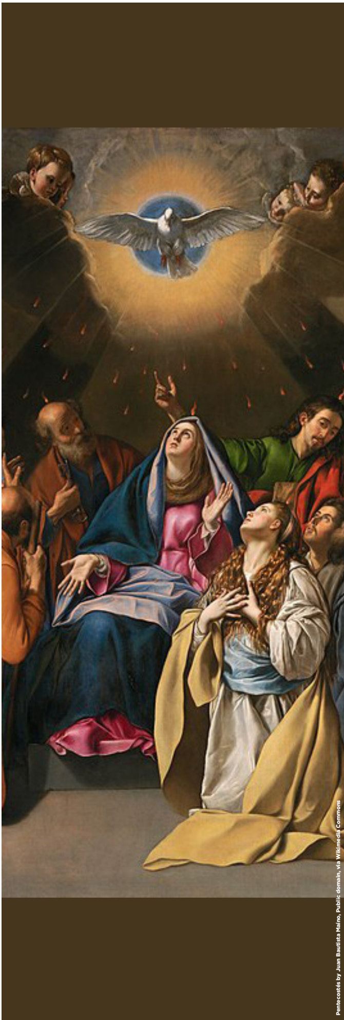
Pentecost by Juan Bautista Maíno

PRAY We thank you, God, for the ways your Holy Spirit helps us see your love through the people and world around us. We thank you for the gifts of the Spirit within us and for the gift of your Son, Jesus Christ. Holy Spirit, open our hearts as we listen to your word. We ask this in Christ’s name.