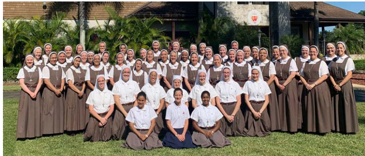
Servants of the Pierced Hearts of Jesus & Mary

You can meet the Sisters at the Fall Festival on Sunday, November 13 th from 10-noon.