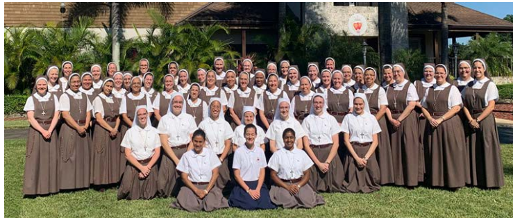
Servants of the Pierced Hearts of Jesus & Mary

You can meet the Sisters at the Fall Festival on Sunday, November 13 th from 10-noon.