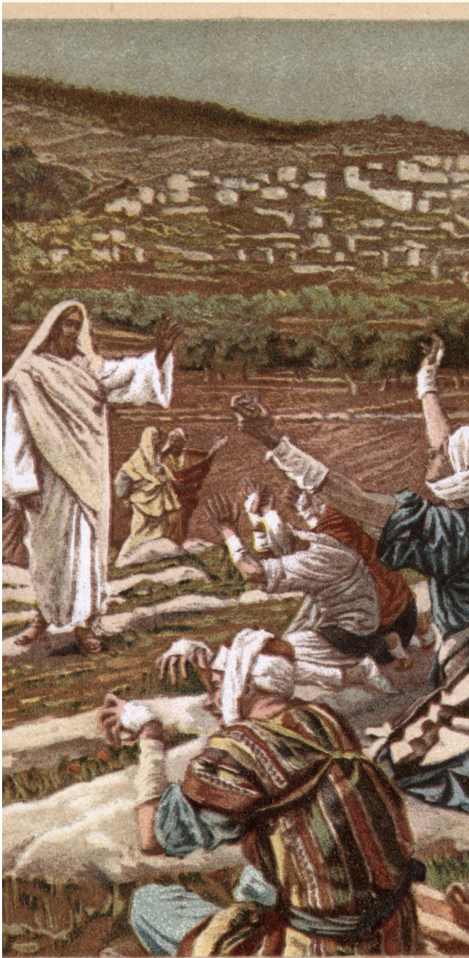
of the ten Lepers.

PRAY We quickly turn to God when things go wrong. Next time something good happens, turn to God with the same urgency and say a prayer of thanks.