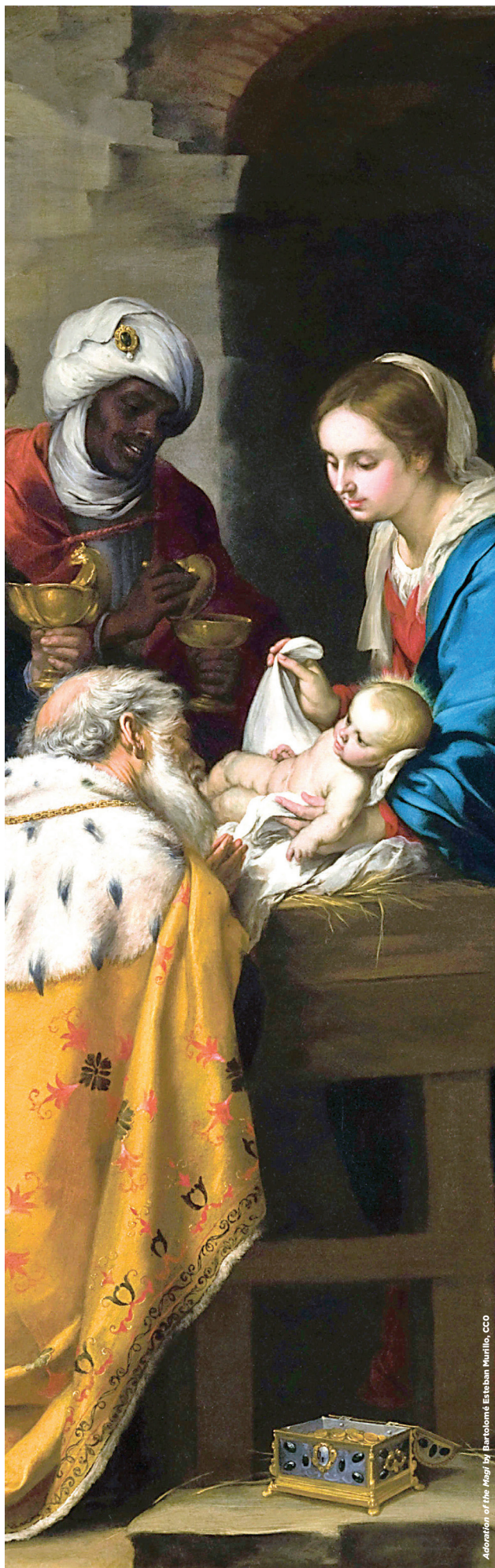
Adoration of the Magi by Bartolomé Estéban Murillo, CCO