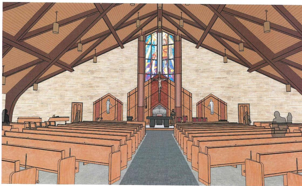
Interior view from new narthex toward altar