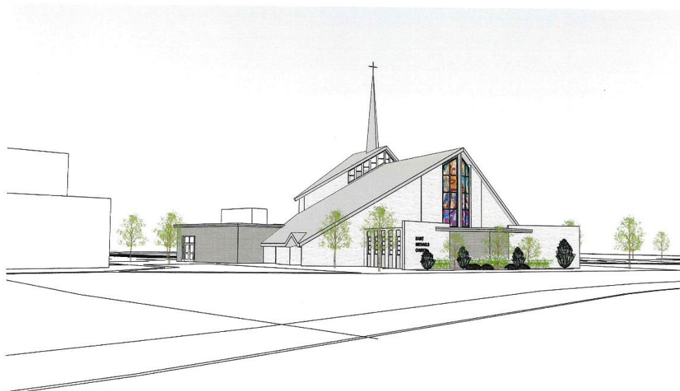
Exterior view from Jefferson Blvd.