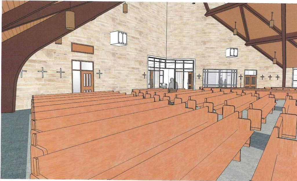
Interior sanctuary looking toward the narthex