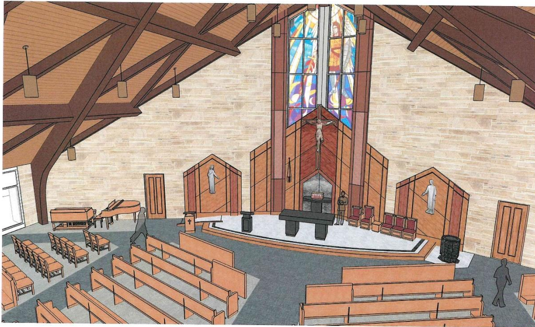
Interior birdseye view