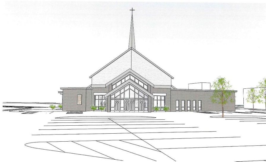
Exterior view from east to west