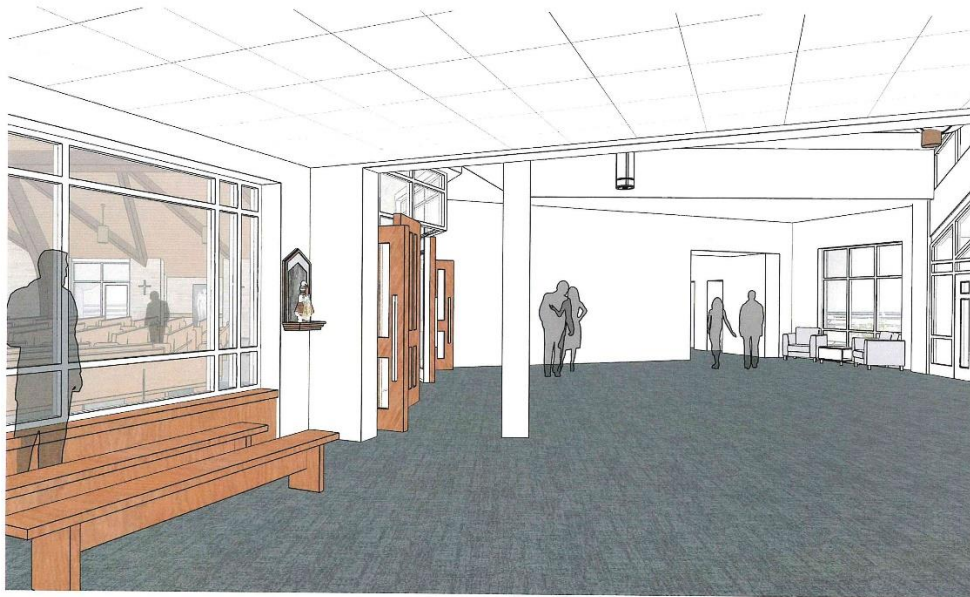
New narthex with sanctuary on the left and exit doors on the right