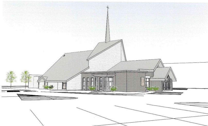
Exterior view from north to south