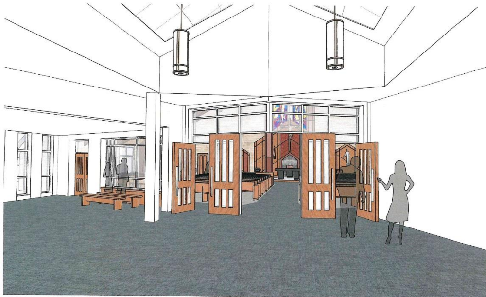
View into sanctuary from new narthex