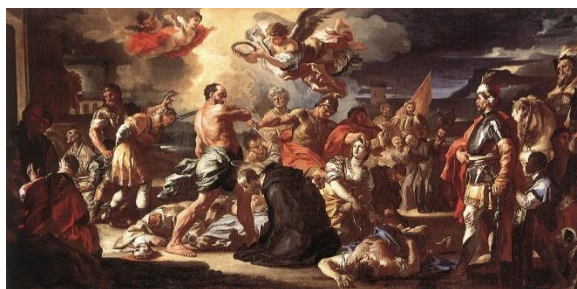
The martyrdom of many saints including St. Placidus