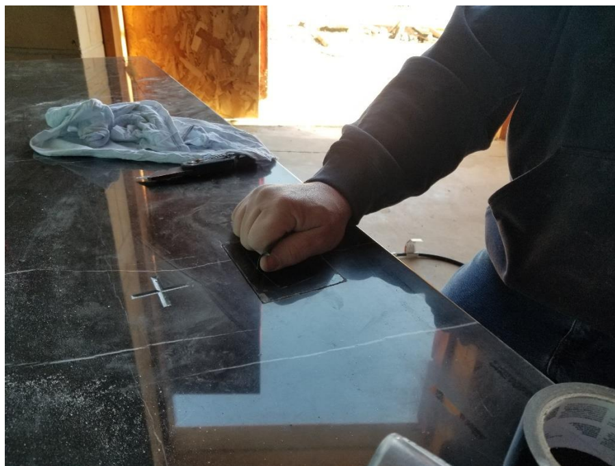
Using tape to lift the stone