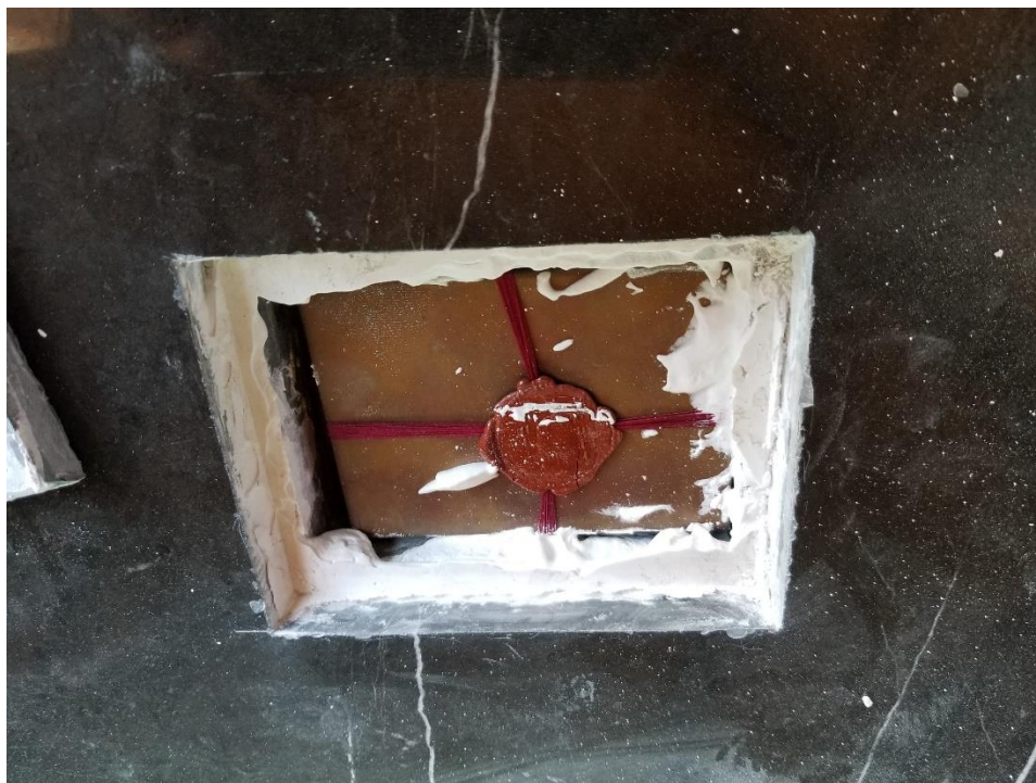
Relic box in the altar