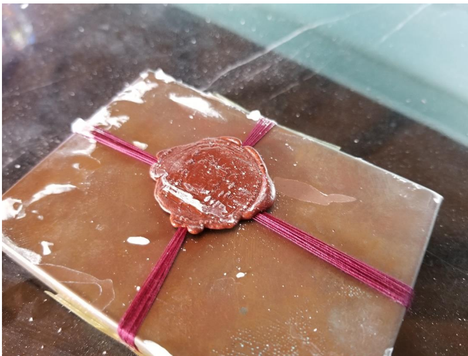
Relic box removed from the altar