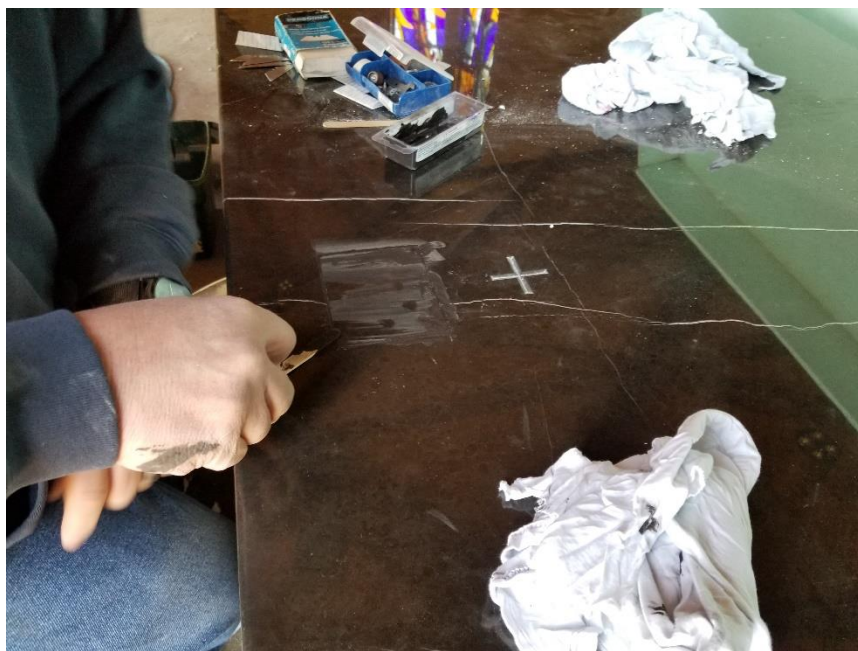
Resealing the relic into the altar