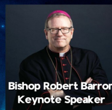
Bishop Robert Barron Keynote Speaker

For Post-Confirmation High School Students