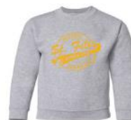
Available in 3 colors

Any questions, please contact the office.