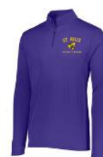
Available in 2 colors