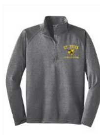
Available in 2 colors