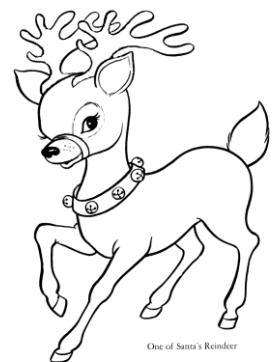
One of Santa's Reindeer

For your calendar...CARES will not be open on December 22 nd , 25 th & 29 th or January 1 st .