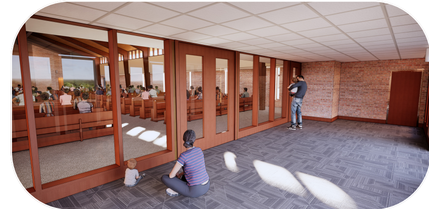
Narthex - New Family Room Space

The Narthex space in the back of Church will get a facelift to welcome families and those needing a separate space from the main Church. A few highlights include NEW: sound, interior and exterior doors, flooring, and movable seating. This project is expected to kick off shortly after January 1, 2024 and will provide a warm space for many, while still allowing them to participate in Mass.