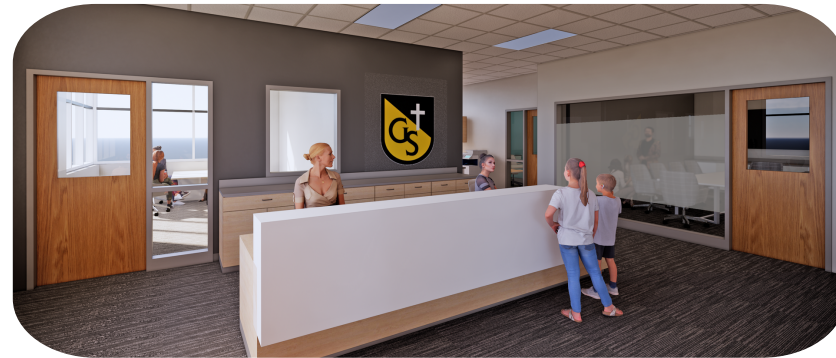
School Welcome Area After Entering Offices

Ground was broken late November to begin construction on the new school offices which will allow for a dedicated secured entryway. The project has been delayed due to waiting on utilities to be moved, but we hope to be moving full steam ahead by January 2024!