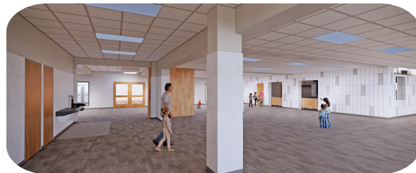
Commons & Cafeteria With Bathrooms

Our new school office will allow for additional dedicated meeting spaces, a teacher workroom, conference room and school nurse room. The project is expected to be completed late summer 2024.