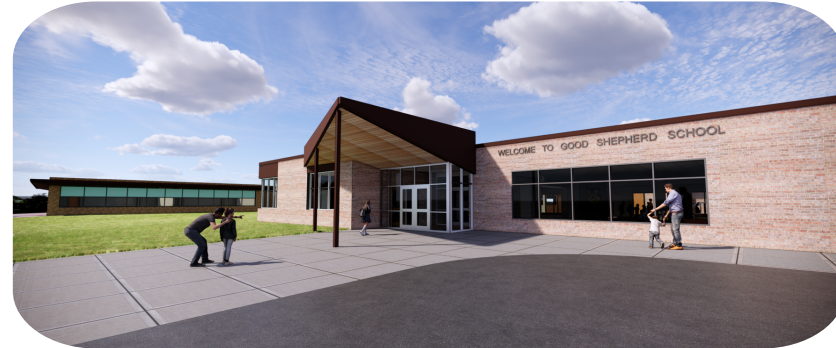
Front Entrance View

Classroom renovations were completed in the Summer of 2023! The groundwork for the new commons/cafeteria also began. Come see the completed music room, media center, learning support rooms, and Spanish room! Also, each of our preschool classrooms received new bathrooms by repurposing maintenance closet space, resulting in a new Kindergarten classroom.