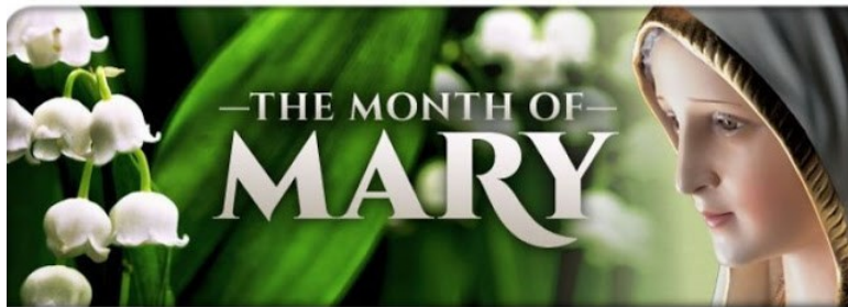
By Plinio Corrêa de Oliveira