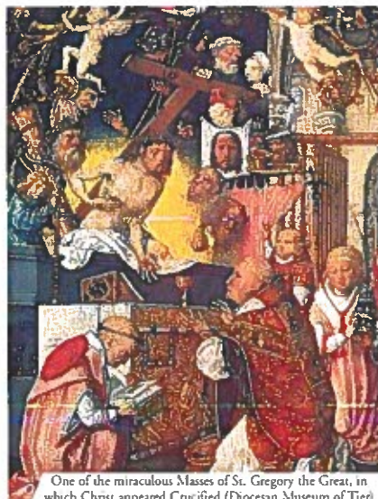
One of the miraculous Masses of St. Gregory the Great, in which Christ appeared Crucified (Diocesan Museum of Trier)