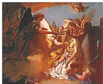
One of the miraculous Communions of Saint Jerome