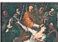
Saint Bernard exorcising a woman with the Blessed Sacrament, The Hieron Museum