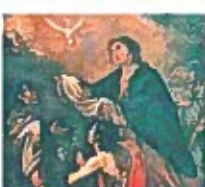
Saint Secondo, before dying, receiving Holy Communion brought by a dove, The Hieron Museum