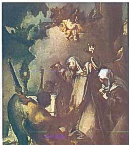
The painting represents Saint Frances of Rome with some of her companions in ecstatic wonder at the Monstrance from which radiant beams of light emanated (Civic Art Museum)

B lessed Angela of Foligno recounted that "on one occasion I saw Christ under the guise of a small child, who nevertheless appeared great and majestic, like a king: It seemed that, seated on his throne, he held in his hand something like a symbol of authority [...] Then, when the others knelt down, I did not do so, and I don't know if I ran up close to the altar or if I could not move from sheer delight and contemplation, and I experienced great regret that the priest put the Host back on the altar so quickly."