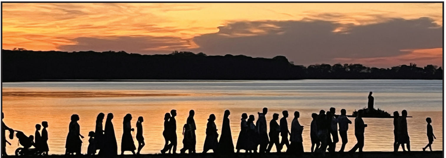
This beautiful sunset magnified Our Lady during the rosary procession from Schoenstatt to St. Mary's Church on Sunday evening, October 1. The procession ended with Benediction at St. Mary's Church.