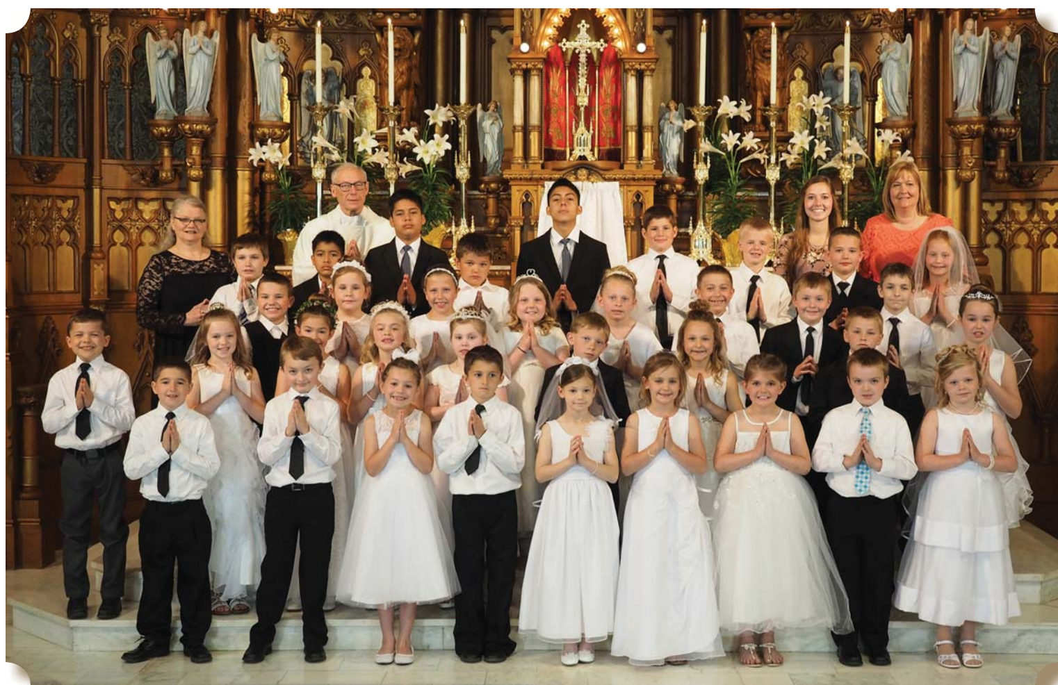
St. Mary's First Communion 2017