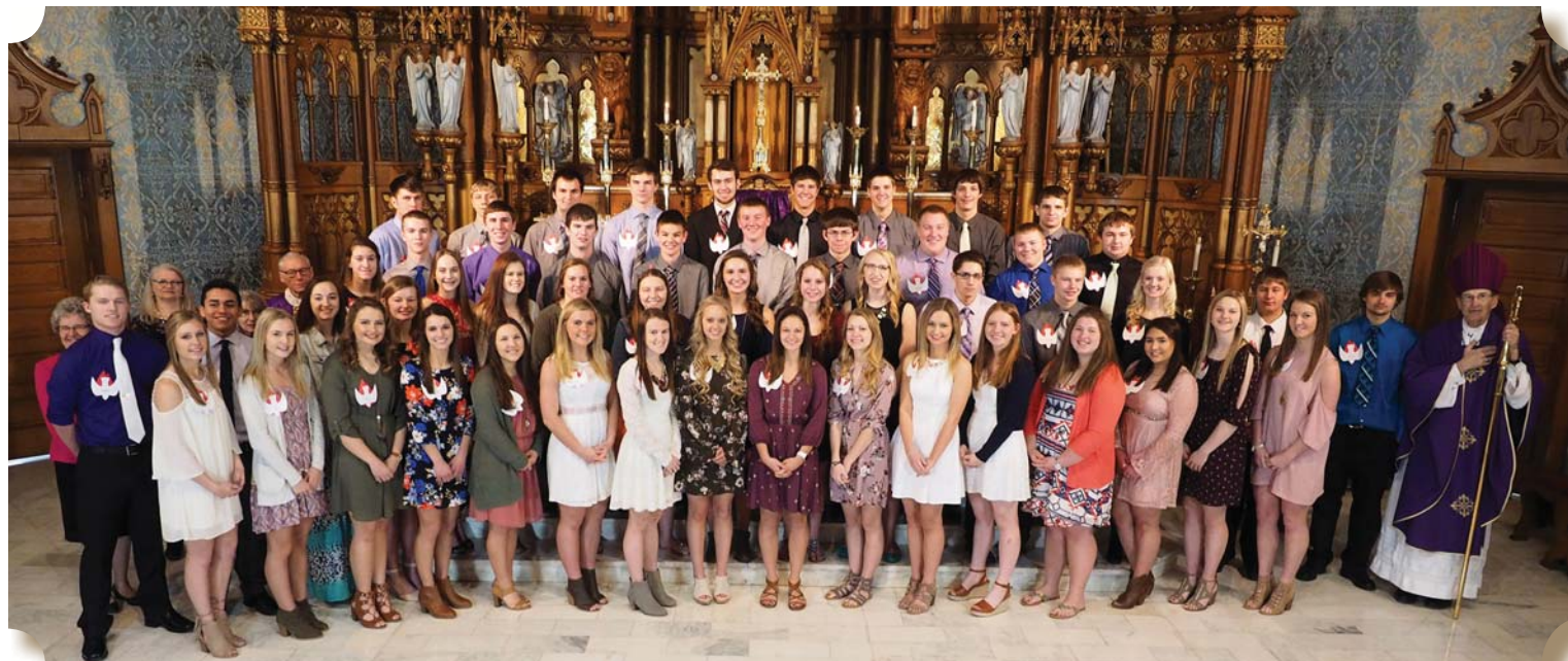
Area Faith Community Confirmation 2017