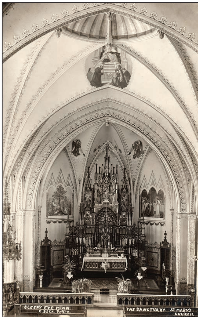
This section is dedicated to the history of St. Mary's Parish.

Here is another photo taken by Miss Claudia Beck in 1911, shortly after the church was decorated for the first time. Notice the mural by the dome (portraying the Coronation of Our Lady as Queen of Heaven and Earth) and that the pointed areas (in architectural terms the “pendentives”) that contain the murals of the Four Evangelists are blank. The Four Evangelists were painted around the dome in the 1944 re-decoration of the church. Also take note of the wooden flooring in the sanctuary. The marble was installed in the 1920's.