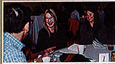
Discussion and conversation about the message