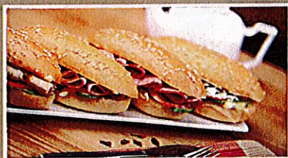
A great (free) dinner