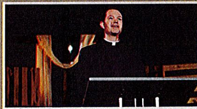
An engaging Bible-inspired message