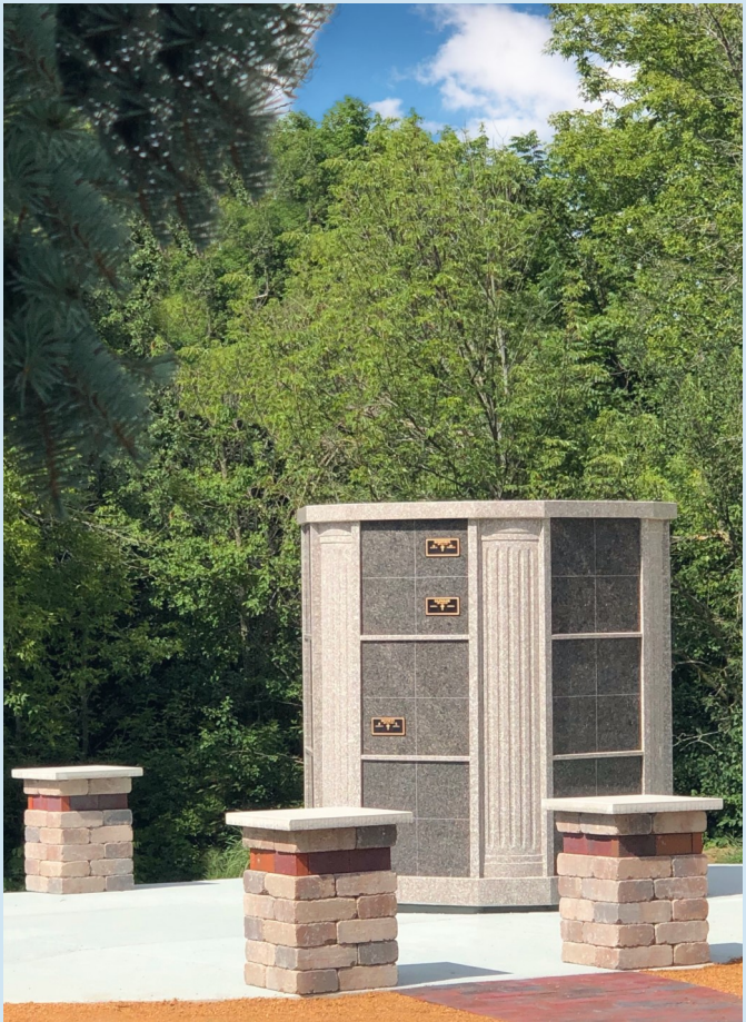
St. Clare Cemetery, Town of Merton