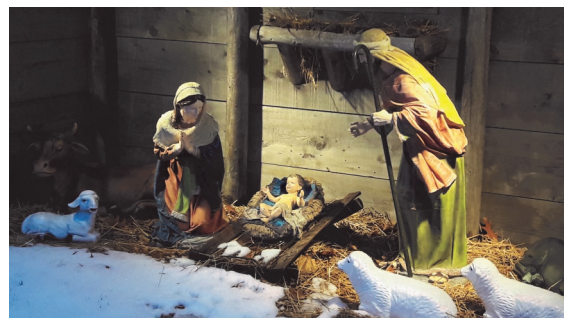
The outdoor manger scene at North Lake.

On the fourth week of Advent, we light the final purple candle to mark the last week of prayer and penance as we wait for the birth of our Savior. This final candle, the "Angel's" or "Peace" candle, symbolizes peace. It also