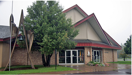
Saint Mary & Joseph Church Carlton, Minnesota

Items and Announcements for the weekly bulletin must be received, in writing, by Noon on Monday.