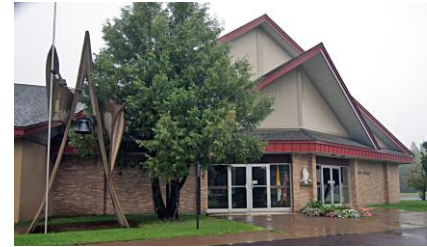
Saint Francis Church Carlton, Minnesota

Bulletin Sponsored by BRM Construction Services and Esko Trail.