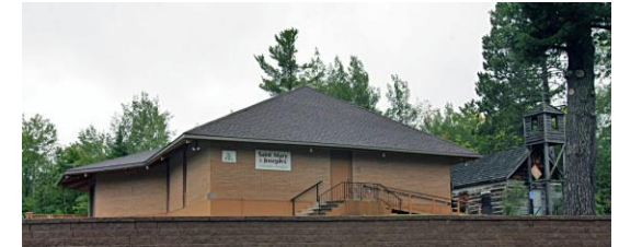
Saints Mary and Joseph's Sawyer, Minnesota