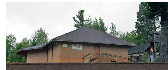
Sts. Mary and Joseph's Sawyer, Minnesota