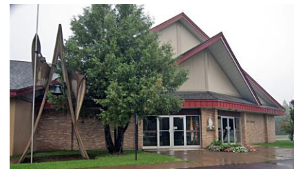
Saint Francis Church Carlton, Minnesota

Pray to St. Michael Saint Michael, the Archangel, defend us in battle. Be our defense against the wickedness and snares of the devil. May God rebuke him, we humbly pray, and do thou, O Prince of the heavenly hosts, by the Power of God, thrust into hell Satan and all evil spirits who wander through the world seeking the ruin of souls. Amen