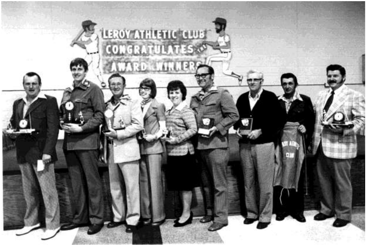
Le Roy Athletic Club leadership awards 1978. Among the recipients were coaches for the Rock River Valley Team, Babe Ruth, and Little League, and umpires and service personnel.