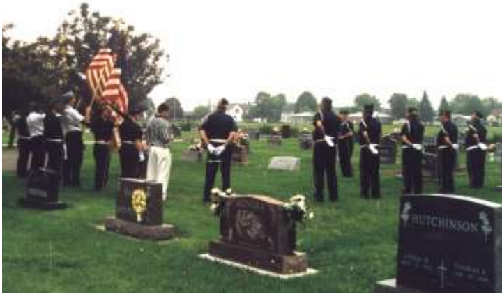
Above: The Squad in 'At Ease' position. Legion Chaplain announces the names of the departed veterans.