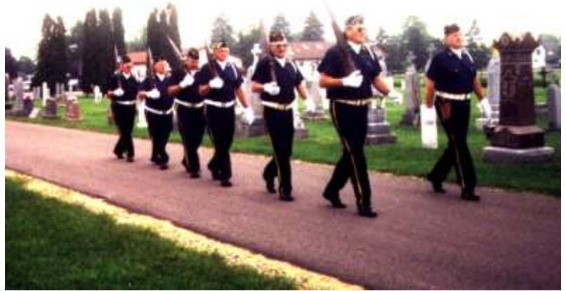
Above: The Bintlzer-Waehler Post 347 American Legion Honor Guard approaching the graveside of the veteran to be honored on Memorial Day May 31, 1999.