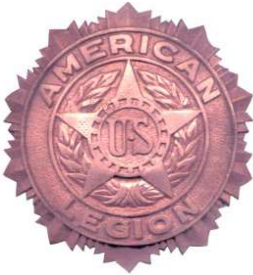
Above: The distinguished American Legion Medallion displayed at veteran's graves in St. Andrew's