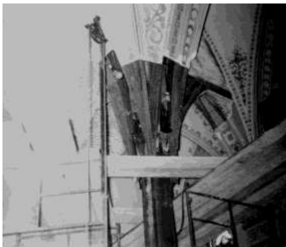
Church interior reconstruction 1958