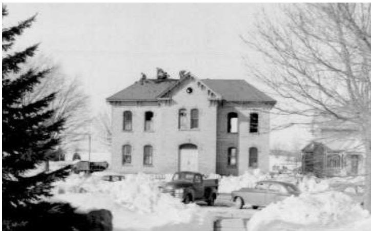
St. Andrew ` school being demolished by men of the Parish 1959 .