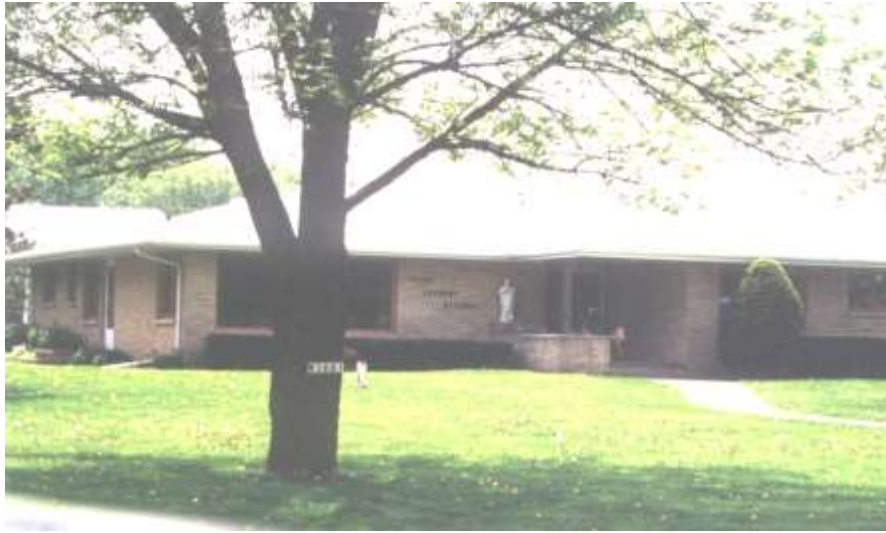
St. Andrew new rectory completed in 1965