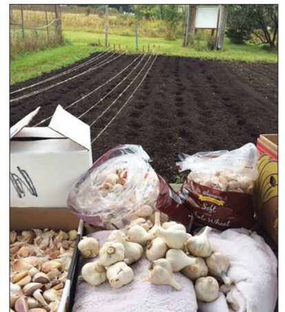
Garlic Harvest from Gift Garden