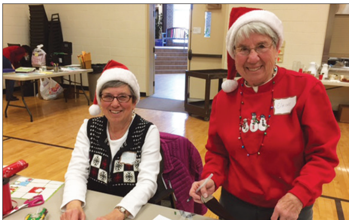
Christmas Basket Program - Wrapping and in the Spirit.