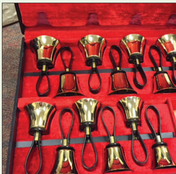
Bells ready for Ringing

The Bell Choir might be the most visible youth music group. Playing the bells is a unique musical experience – each bell plays one note, and only through the team work and spot-on timing of the bell ringers can cohesive music be made. For that