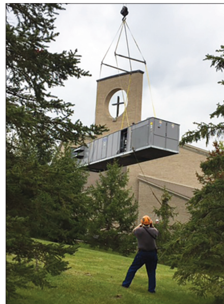
HVAC Unit Being Replaced

So, what about the Education Center? Most of our youth formation activities take place there – Bridges of Faith, the High School and Middle School Youth Groups, and of course Bible School. In addition, the building is used by Community Sponsored Agriculture (each Thursday afternoon from June – November), Men's Fellowship, Yoga, and many other activities. We also rent out the Education Center on occasion, to religious organizations like Mercy High School,