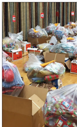
Ready for Delivery!

Basket Delivery Thursday, 12/21, 9 a.m. - Noon