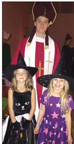
Trunk or Treat