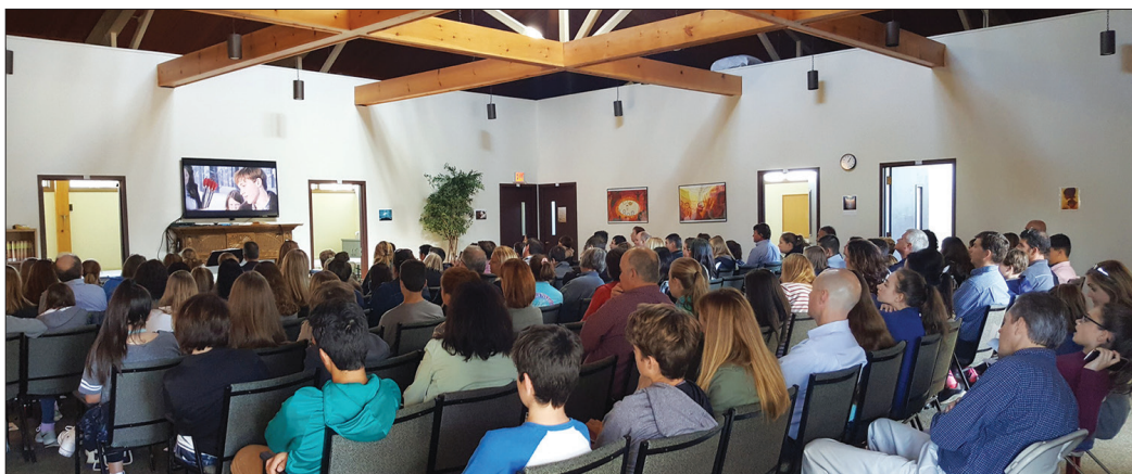
Confirmation Year One Retreat