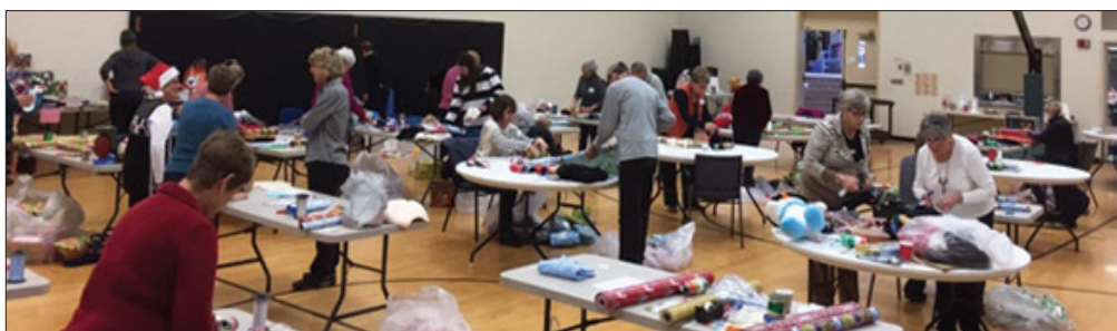
Christmas Basket Program - Parish Life Center Full of Christmas Spirit.