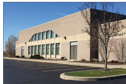
Parish Life Center

when they want to be off-campus for retreats.