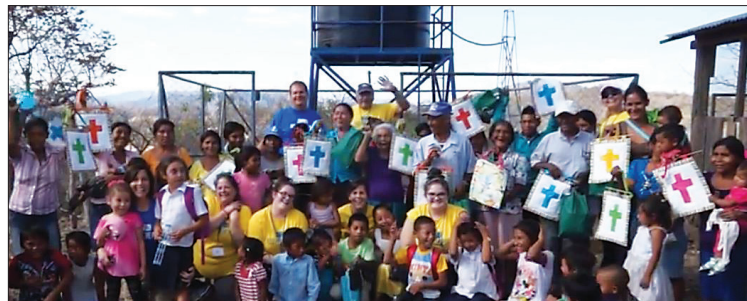
Transfiguration Visit to Nicaragua in 2017