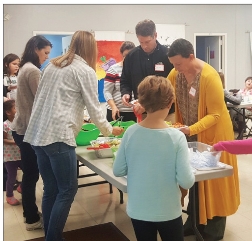
New Bridges of Faith Youth Formation Program - Shared Meals and Learnings