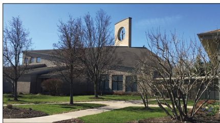
Church and Parish Office

Anyone walking into our church this winter will be welcomed with warmth – from the smiles of our greeters and the heat output of the HVAC system installed late this summer. Thank you to all who have given to the Building Restoration Fund, to date we have approximately $444,000 pledged. Pending work includes replacing drainage lines and downspouts, and sealing the heating ducts to prevent further water damage. We hope to complete this effort soon, and some of it may have been finished while this newsletter was being completed! Next year we will replace the Church roof, and repair the PLC roof.