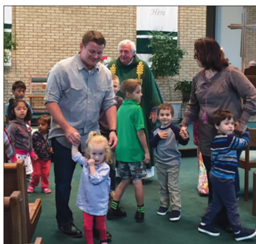
New Youth Formation Program - Wee Ones Word