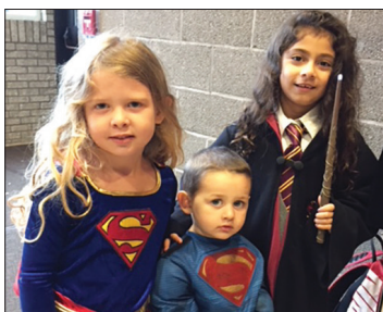
Trunk or Treat