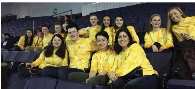
Teens at Worship Night in America