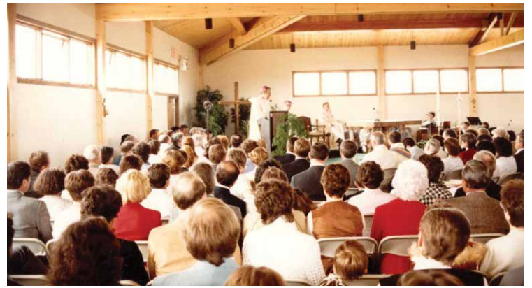
Mass in the former Church - now the Education Center.