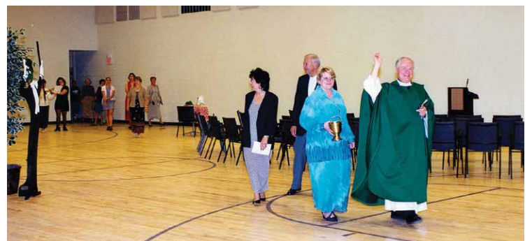
Opening the Parish Life Center