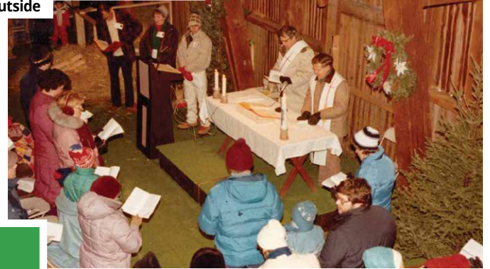
Christmas Mass 1983