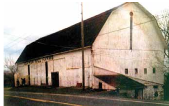
Barn at Clover

Please save the dates, and plan on joining in on the fun! Additional details will be available in the bulletin, on the Transfiguration website and by weekly e-mails as the dates grow closer.