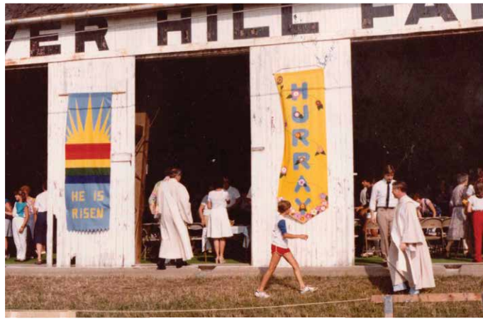
First Mass 8-6-83 Outside

Our Parish was formed in early 1983, but had no place of worship. The first Mass was held August 6, 1983 in the Barn at Stone and Clover at Stone and Clover