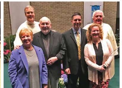
RCIA at Easter Vigil