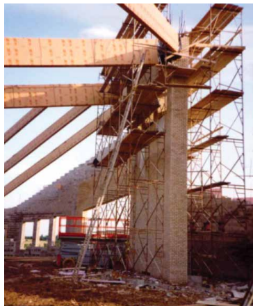
Building the altar wall, also known as the Children's Wall.