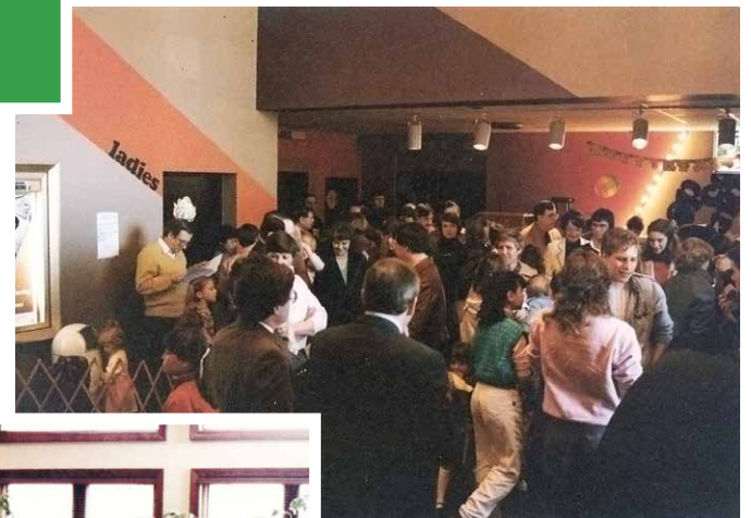
Mass at Jo Mor

Jo Mor and Christ Clarion housed our Masses during the cold months, when the Barn was unusable. We remain grateful for their hospitality.