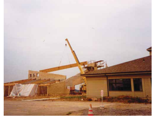
New Church being built next to Parish Office

Parish Offices were originally located in the Rectory basement on Van Voorhis Road. A new Parish Office was completed on West Bloomfield in May, 1992