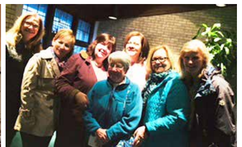
Women's Booneville Kentucky Mission