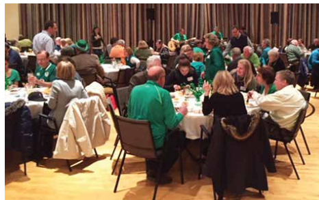
Irish Fish Fry Fest