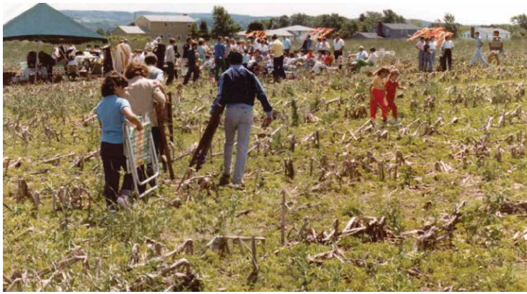
Preparing for the first church on West Bloomfield Road.