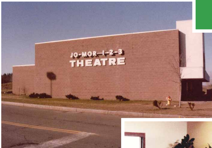
Jo Mor Theatre