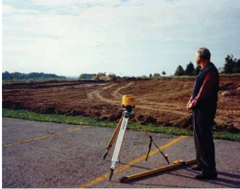
Surveying for the New Church

On May 4, 1985, the cornfield at 50 West Bloomfield Road became our first Church building (now the Education Center). Yes, we sat on folding chairs!