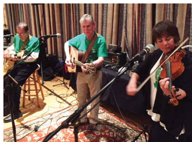
Irish Fish Fry Fest