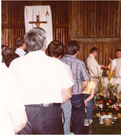
First Mass 8-6-83 Inside

December 24, 1983, our first Christmas Eve Mass was held in the freezing cold barn. The barn-yard animals made it feel like the very first Christmas.