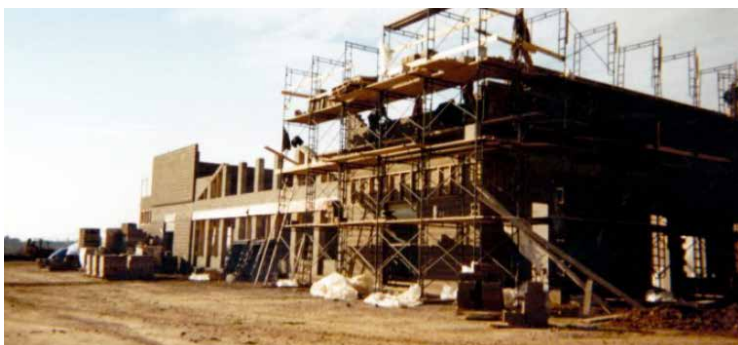
Constructing the Parish Life Center