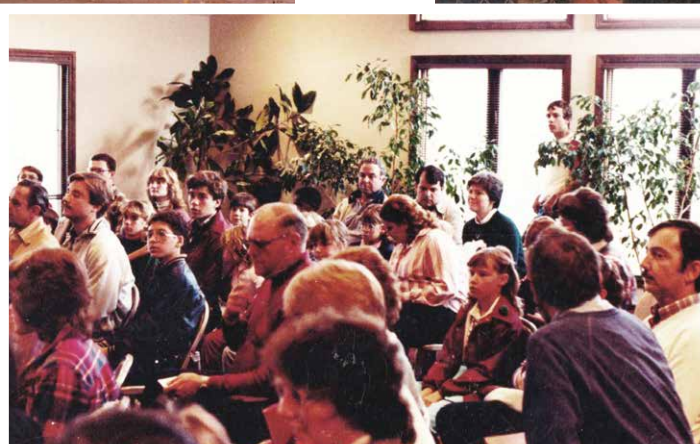
Worship at Christ Clarion