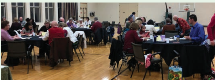
Ash Wednesday Pot Luck