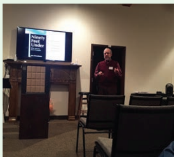
Men & Women in the Spirit