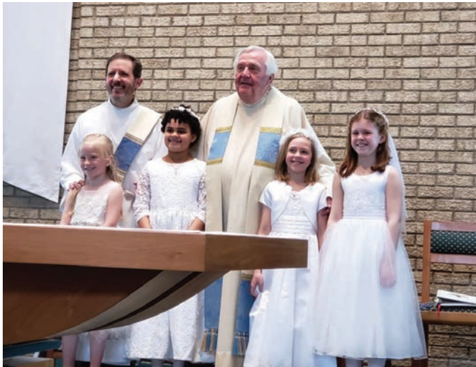
9 a.m Mass - May 5