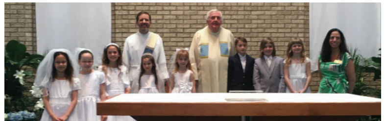
11:30 a.m. Mass - May 5