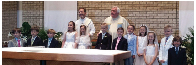
4:30 p.m. Mass - May 4