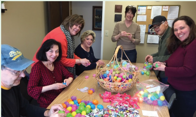
Easter Egg Filling