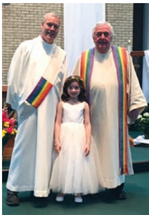
11:30 a.m. Mass - May 12