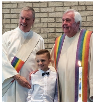
4:30 p.m. Mass - May 11