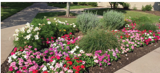
Flowers from Terry and Armond