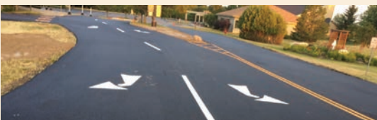
Parking Lot Entry Pavement Replacement