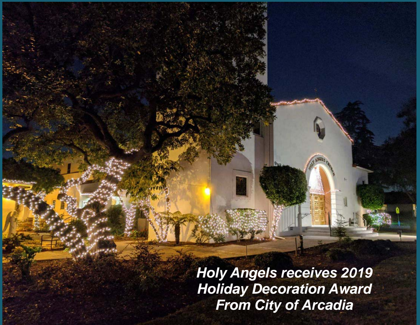
Holy Angels receives 2019 Holiday Decoration Award From City of Arcadia