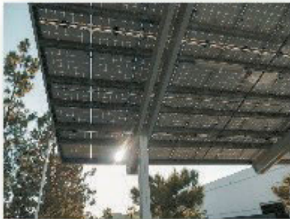
Install Solar Carport

Help us reach our landmark goal of $2,250,000! We've already raised $1,671,777 , but we need your help to reach the finish line. Donate today and invest in the future of our parish, school, and ministries.