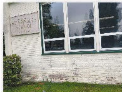
Paint the School Building

The following are a few examples of projects that will be essential in the near future.