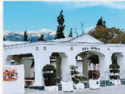
Gathering Center Renovation