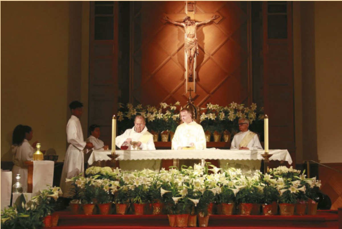
Photo from Easter Vigil April 20, 2019