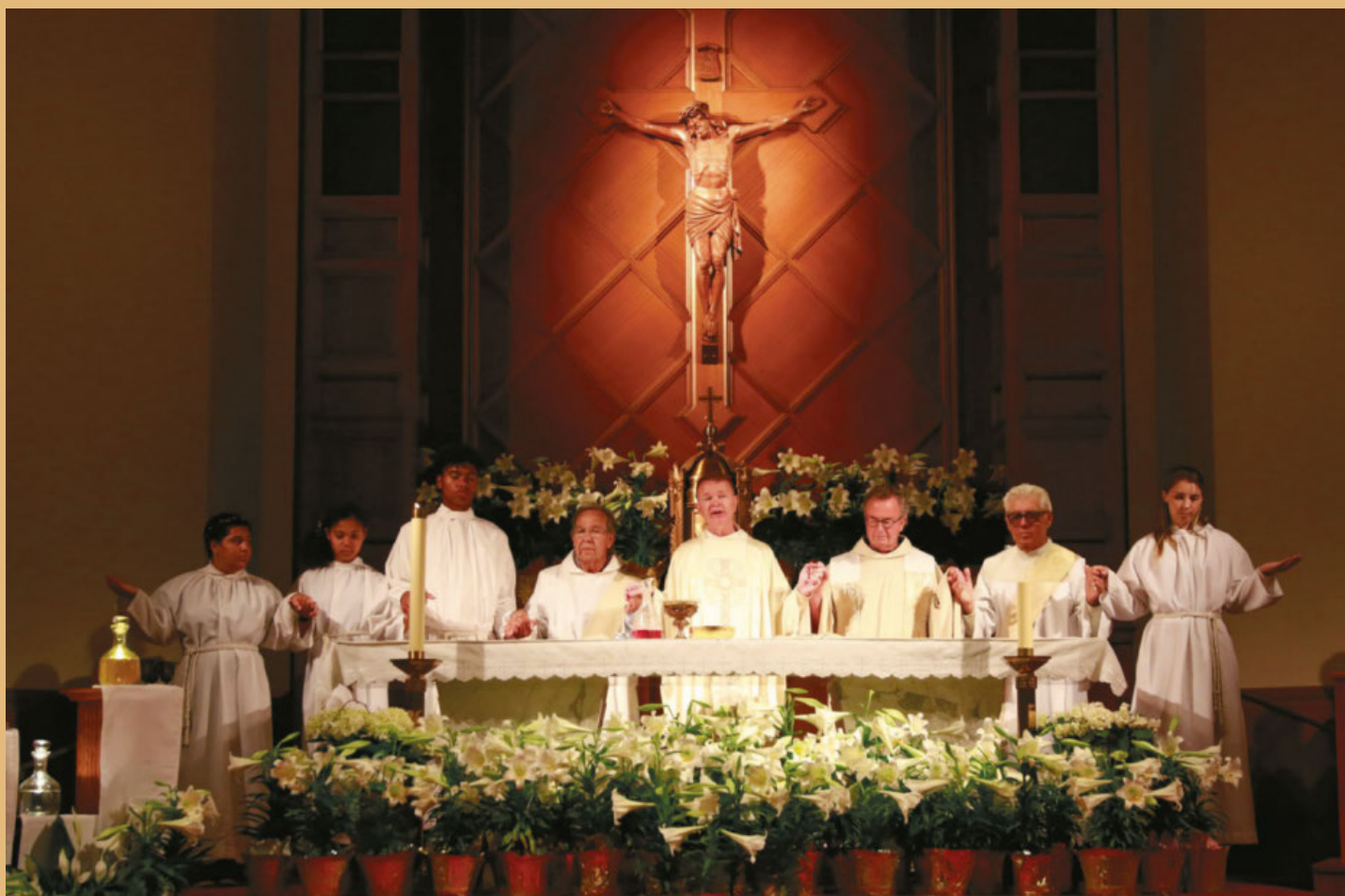
Photo from Easter Vigil April 20, 2019