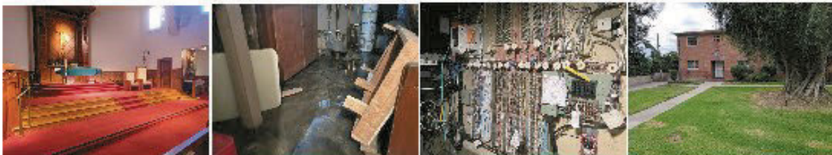
New carpet in the church, waterproofing church basement, phone system upgrade, & convent repairs.

The following are a few examples of projects that will be essential in the near future.