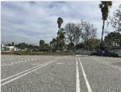
Parking Lot Repairs