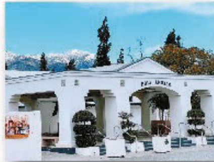
Gathering Center Renovation