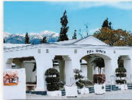
Gathering Center Renovation