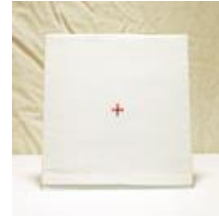
Pall - This is a stiff, square white cloth cover that is placed over the chalice to protect its contents. (Notice the red cross)