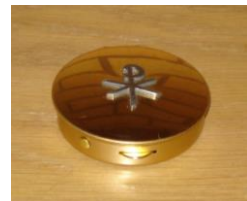
Pyx is a small round container used to carry the consecrated host (Eucharist), to the sick or those otherwise unable to come to a church in order to receive Holy Communion