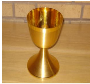
CHALICE – The cup that holds the precious Blood of Jesus