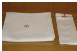
Corporal - A square piece of white cloth (shown here folded) spread over the altar cloth. The chalice, paten and ciboria are placed on it during the Liturgy of the Eucharist.