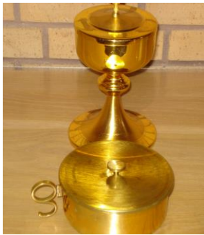
CIBORIUM – The vessel containing the precious Body Of Jesus. Most have a lid. Some for distribution can be in the shape of a bowl or plate (See Next Under)