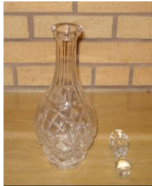
WINE FLAGON (w/ Stopper) Used to wine which is poured into the Chalice