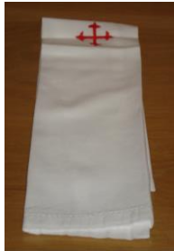
Purificator This is a rectangular, white cloth used to clean the chalice. (notice the red cross embroidered in the cloth).