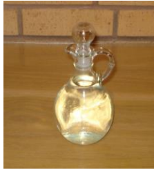
CRUET(S) These are the smaller glass pitchers that hold the water and wine which is poured into the Chalice