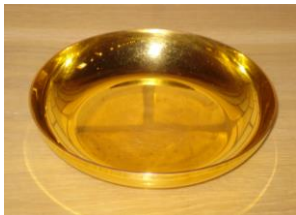
PATEN – Holds the Priest Host