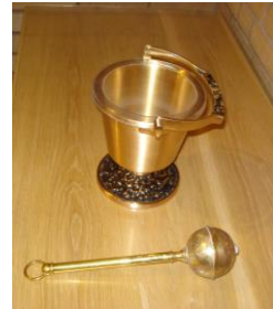
Aspersorium & Aspergillum The Aspersorium is the holy water vessel. The Aspergillum is the long tube-shaped item that holds the holy water to sprinkle the faithful or articles to be blessed