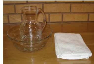
Lavabo Dish or (Finger Bowl) and Water Pitcher The dish that is used for washing the Priest's hands during the preparation of the gifts.