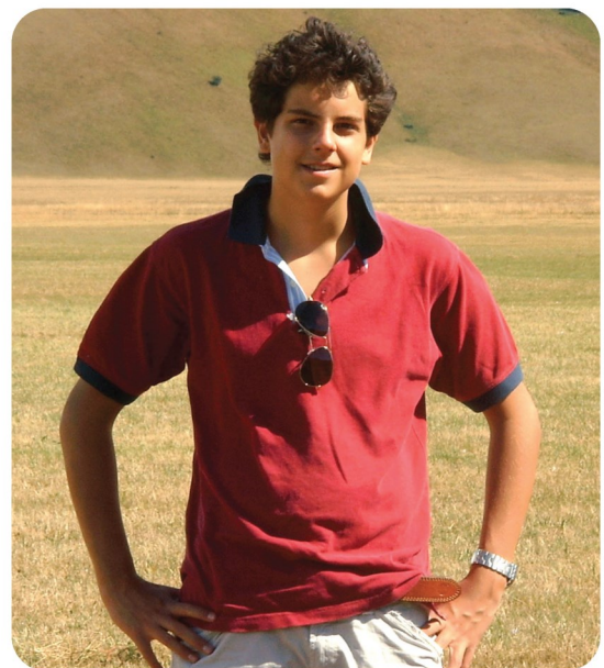
Blessed Carlo Acutis (1991–2006) served the needy and built an internet gateway for exploring eucharistic miracles.