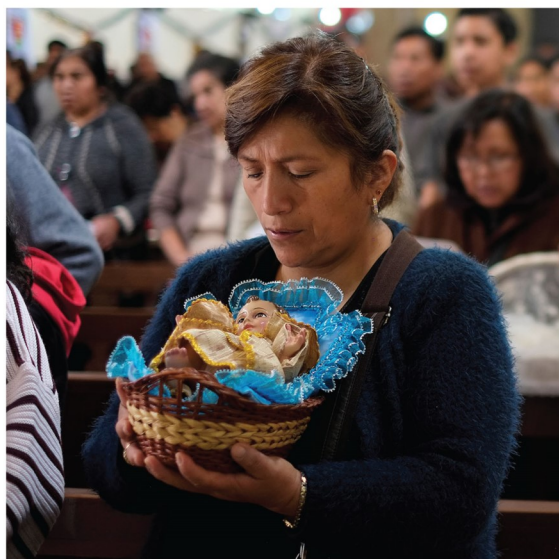
A woman holds a figurine of the Christ Child during Mass on the feast of the Epiphany.

Epiphany, on the other hand, is made for celebration, gift-giving, going all out. Perhaps someday we can return to the traditions of Epiphany and restore Christmas as a day of rejoicing and worship.