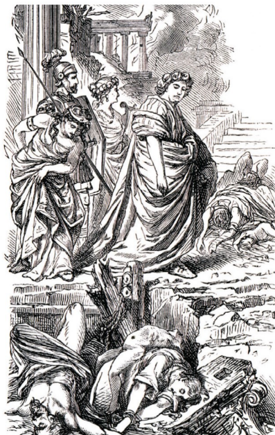
ROMAN EMPEROR NERO, LEFT FROM “HISTORY OF THE CHURCH” AROUND 1880

Instead of worrying about the end of time, an Antichrist, a final battle, and “evil” numbers, Catholics are encouraged to believe that Christ has already conquered sin, death, and Satan. God’s reign is already here in our midst (see Luke 17:20–21). Our task is to prepare for our own moment of dying and meeting the Lord. We leave the rest to God’s providence!