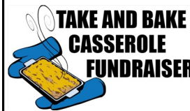
table in the Gathering Space. Casseroles for sale this year are: Pizza Casserole and Tater Tot Casserole that will be available for pick up on September 10/11 and Chicken Taco Bake and Chicken & Wild Rice Casserole that will be available on September 24/25. Two sizes of casseroles are being sold: A 9 x 13 size for $30.00 and 8 x 8 size for $20.00. All order forms must be returned by Thursday, September 1 . Any questions? Please call 920-467-4046 and leave a message.

Blessed Trinity Parish is having a "Take & Bake Casserole Fundraiser" again this year. Order forms are available on the