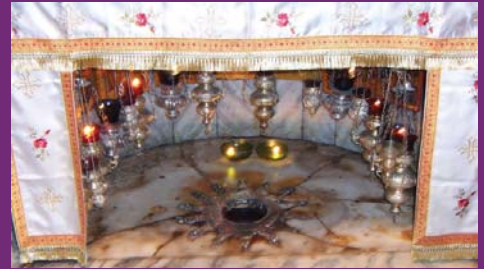
Star marks the spot where Jesus was born

invites you to join him on an 11-day pilgrimage to Israel