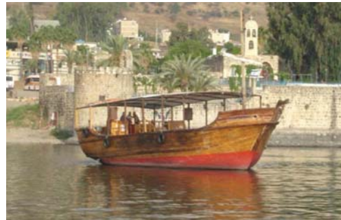
BOATING ON THE SEA OF GALILEE

and within which Jesus made his base of operations for His Galilean ministry. As we visit the ruins of the town you will find out why Jesus focused his ministry here, where ancient Judaism flourished. We visit the Synagogue where Jesus healed and taught and also visit the church that was built over the ruins of Peter's house. Tabgha , location of the miracle of the loaves and fishes and the nearby Church of St. Peter's Primacy are our next stops before we enjoy a relaxing boat ride on the lovely Sea of Galilee . Time permitting, we visit the ancient boat at Kibbutz Nof Ginosar, which was dated back to the time of Christ. Our day concludes as we return to our hotel for dinner and overnight. [B,D]