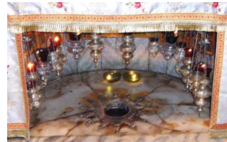
STAR MARKS THE LOCATION OF JESUS' BIRTH

we head further south to Qasr El Yahud , the actual site where Jesus was baptized in the River Jordan. We renew our baptismal promises. Next, we visit Jericho , the world's oldest city. From the excavated tel atop the ruins of ancient Jericho, we view the lush green Jordan Valley, Elisha's spring and Qarantal, the Mount of Temptation. We continue on to Jerusalem to check in at our hotel for dinner and overnight. [B,D]