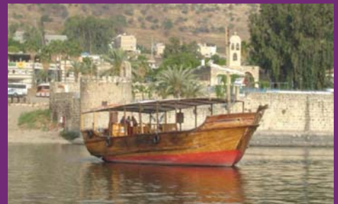
Boating on the Sea of Galilee