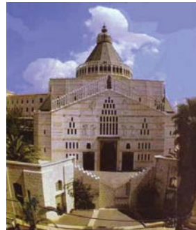
CHURCH OF THE ANNUNCIATION

Nazareth. Nearby is Cana, the place where Jesus performed his first miracle. We stop there and couples may renew their wedding vows at the place where Jesus changed the water into wine at the wedding in Cana . From there, we drive to the top of Tiberias we have a splendid view of the city and the Sea of Galilee. We proceed to our hotel in Tiberias to check in for dinner and overnight. [B,D]