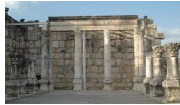
THE SYNAGOGUE, CAPERNAUM

The Mount of Beatitudes is a beautiful, peaceful place well suited for contemplative reflection and prayer. It is here that we begin today's journey. Then, we proceed to Capernaum , where Peter lived