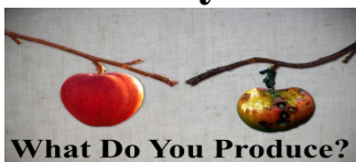
What Do You Produce?

"A good tree does not bear rotten fruit, nor does a rotten tree bear good fruit"